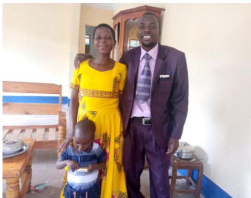
Kiwira Coal Mines congregation's Pastor and his family.