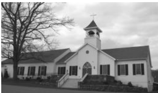
Trinity Evangelical Lutheran Church of Colebrook Colebrook, Pennsylvania